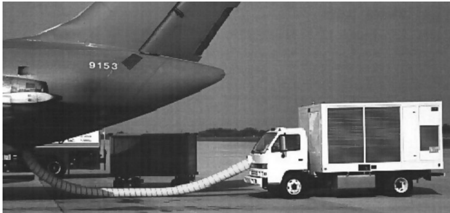
Model 5080DE Truck Mounted