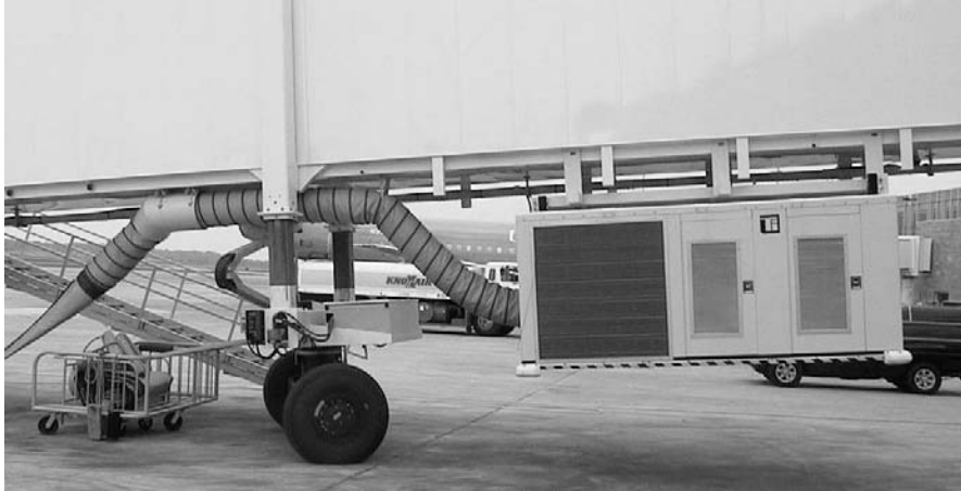
Model POU300 Bridge Mounted