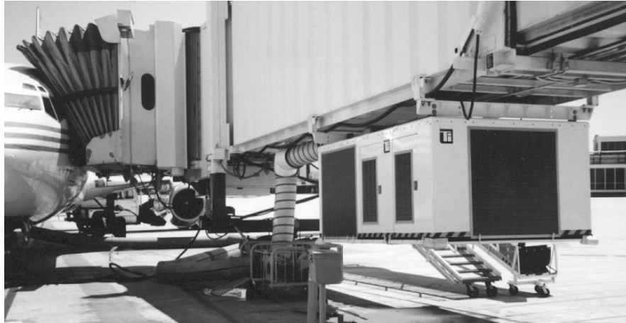
Model POU200 Bridge Mounted