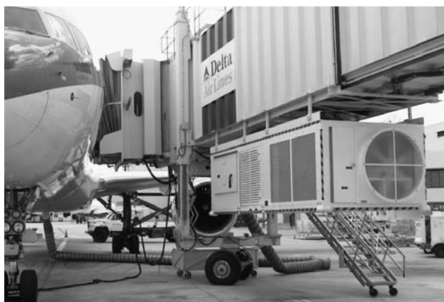
Model DXU90 Bridge Mounted