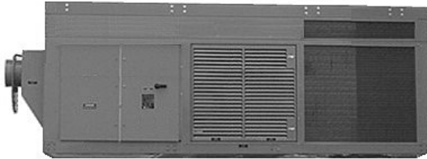
Model DXU60 with Bridge Mounting Rails