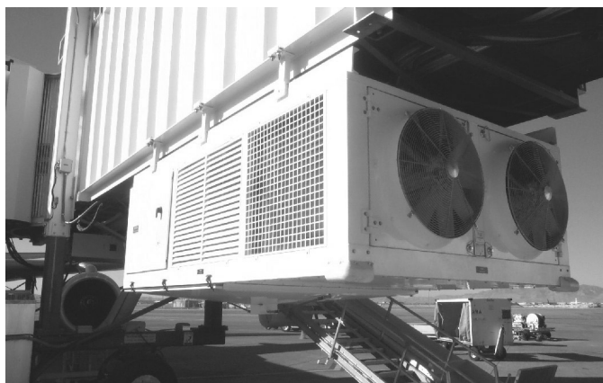
Model DXU45 Bridge Mounted