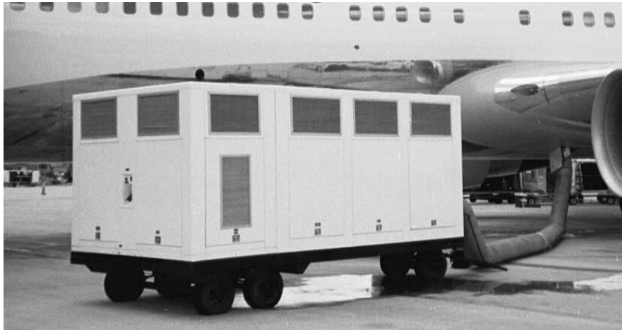
Model DAC900 Trailer Mounted