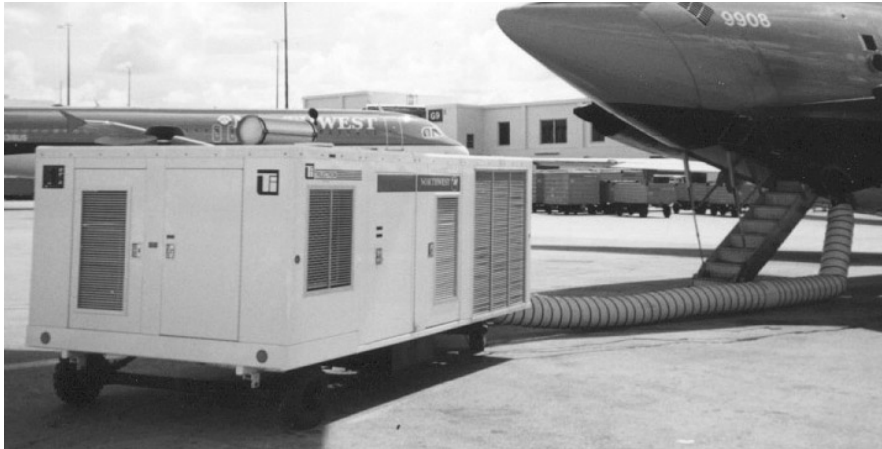
Model DAC300 Trailer Mounted