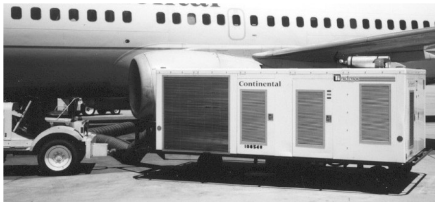
Model DAC200 Trailer Mounted